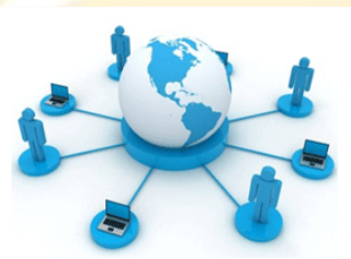
Web Portal Enrolment